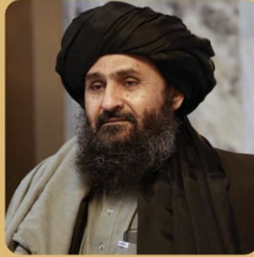
ABDUL GHANI BARADAR POLITICAL HEAD