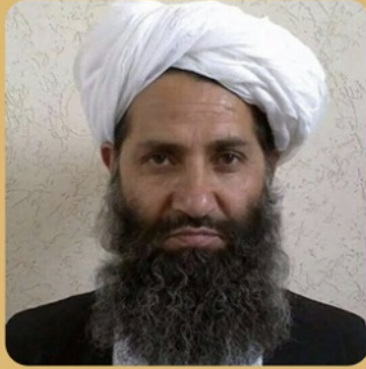
HAIBATULLAH AKHUNDZADA SUPREME LEADER