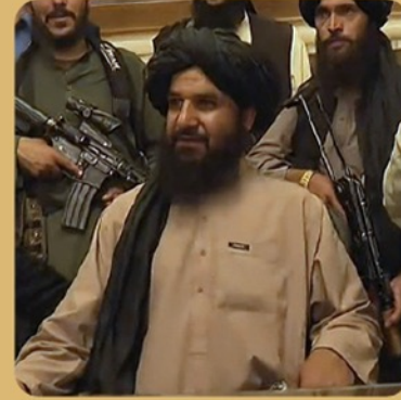
MULLAH YAQOOB MILITARY HEAD