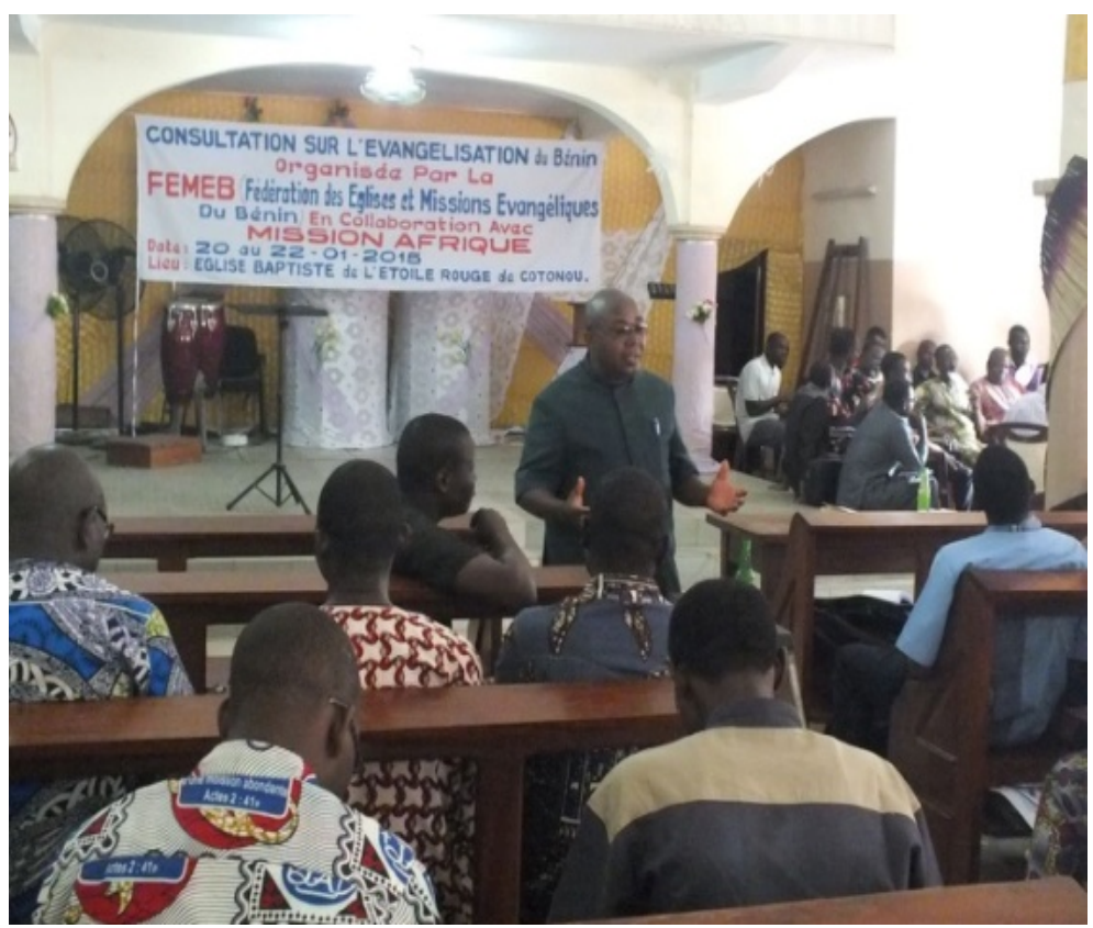
Mission Africa Consultation in Benin 201