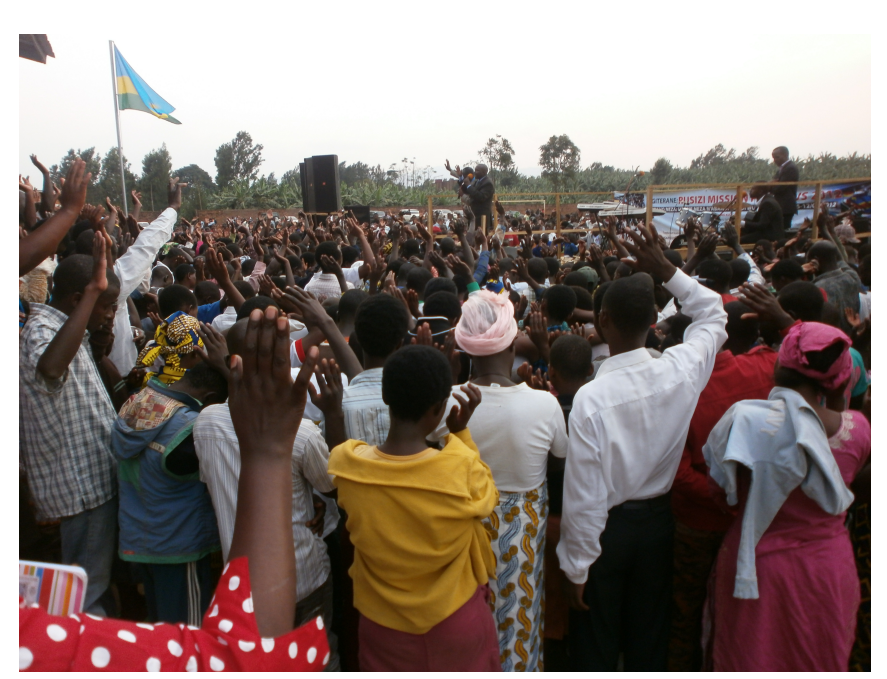
Many people were reached by the gospel