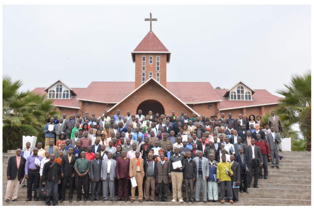
Photo 4: A group of Pastors and Evangelists were trained in Musanze (2013)