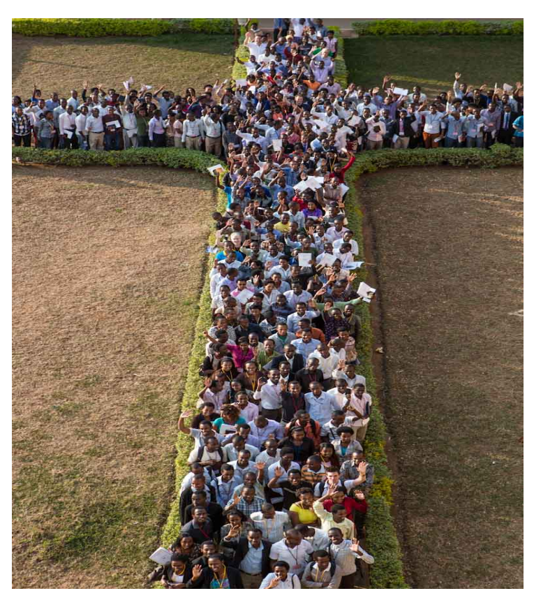
Photo 5: In 2014, over 500 students from different universities in Rwanda were trained in Evangelism