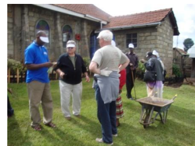
Preparing to sweep the city