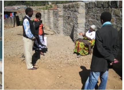
Person to person evangelism