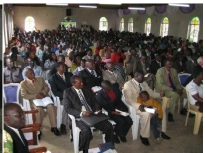
Visiting and local missioners at the launch