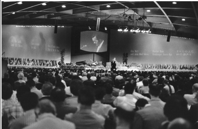
1974 Lausanne Congress

In 1966 the Billy Graham Evangelistic Association, in partnership with America's Christianity Today magazine, spon-